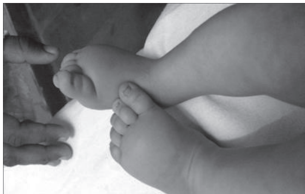
Figure 1: Bilateral primary congenital lymphedema in lower limbs.

Lymphedema is abnormal build-up of fluid in extremities due to malfunction or malformation of lymphatic system. Lymphedema is classified as primary or secondary. Hereditary lymphedema is also known as primary lymphedema. Primary lymphedema is classified according to time of onset. Congenital lymphedema which is present at birth or soon thereafter is known as Milroy disease and primary lymphedema presenting between 1-35yrs of age is called lymphedema praecox or Meige disease which is mostly sporadic. (1) Actual incidence of Milroy disease is not exactly known. Milroy disease shows autosomal dominant pattern of inheritance with reduced penetrance 80-90%. (2) The FLT4 gene provides instructions for producing