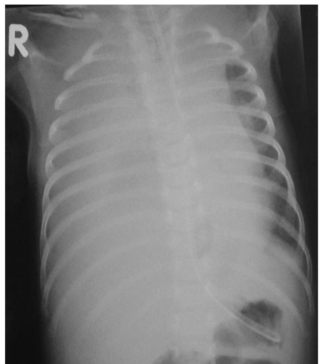
Fig 1: Chest X-ray showing complete opacification of the right hemithorax with mediastinal shift to the left suggestive of massive right side pleural effusion.

cyanosis with oxygen saturation dropping to as low as 30% necessitating immediate tracheal intubation with positive pressure ventilation by bag and mask and cardiac massage. The patient was immediately shifted to intensive care unit (ICU) with mechanical ventilation support. Bedside anteroposterior chest radiograph was performed as shown in figure 1, which revealed complete opacification of the right lung and mediastinal shift to the left suggestive of massive right side pleural effusion. It was immediately confirmed by bedside ultrasound of chest followed immediately by insertion of a 28- French pigtail catheter under ultrasonographic guidance by interventional radiologist. A total of 80 cc of clear fluid was obtained from the chest drain, which was compatible with the fluid the patient received through the intravenous catheter. The external jugular vein cannula was removed and two peripheral lines were inserted for intravenous fluids and medications. The patient's condition improved with marked relief of the respiratory distress and improvement of the oxygenation. Follow-up chest X ray (figure 2) done after 12 hours showed good expansion of right lung with no re-accumulation of fluid hence the baby was extubated and chest drain was removed the next day. After this the baby recovered well and oral feeds were established on 5th post operative day. The baby was discharged home in good general condition and chest X-ray done at one month follow up visit was normal.