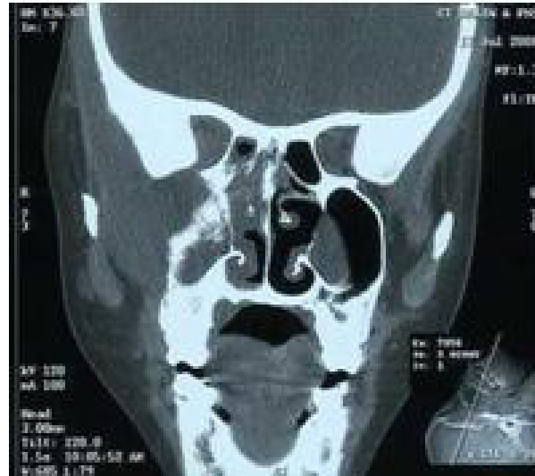
Figure 1- Coronal CT image showing bone erosion & extension of tumor to infratemporal fossa.

scan of nose & nasopharynx demonstrated mass filling the nasopharynx (figure 1). Patient underwent nasoendoscopic biopsy, which confirmed the diagnosis of undifferentiated nasopharyngeal carcinoma (Type III). Patient was referred for radiotherapy. External beam radiation in the dosage of 66GY in 33 divided fractions were delivered to the nasopharynx with concurrent chemoradiation (carboplatin, 5 -FU).