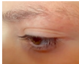
Figure 4. Clinical cure without complications (after 5 months).

A 5-month course of oral griseofulvin was necessary for clinical cure, without complications (figure 4). The family later reported the same fungal skin lesions in the boy's stepfather and in their two dogs.