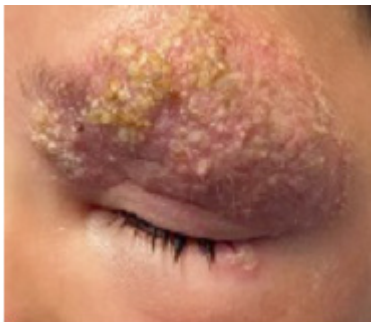
Figure 1. Initial Presentation

The analytical study documented leukocytosis and neutrophilia. Head CT confirmed preseptal cellulitis and no changes were found in the cerebrospinal fluid. Preseptal cellulitis associated with herpetic lesion and bacterial superinfection was assumed and the boy was admitted to the Pediatric ward for therapy with intravenous amoxicillin + clavulanic acid 150 mg/kg/day and acyclovir 30 mg/kg/day.