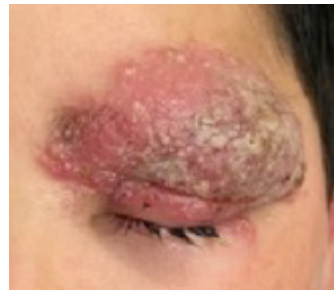
Figure 3. Day seven admission.

A 5-month course of oral griseofulvin was necessary for clinical cure, without complications (figure 4). The family later reported the same fungal skin lesions in the boy's stepfather and in their two dogs.