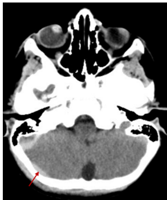
Figure 1. Initial noncontrast head CT performed in the emergency department showed a small retrocerebellar subdural hematoma, with 4 mm, with focal hyperdensity (arrow).

a vitamin K antagonist (VKA) on the fifteenth day, that was continued for six months and maintained heparin until reaching a therapeutic INR (International Normalized Ratio). He was discharged on the twenty-first day with no deficits. Six months later, a head venous MRI revealed complete recanalization of the sigmoid sinus and coagulation studies did not reveal other possible underlying causes.