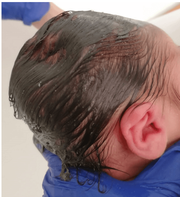
Figure 1. Depression in the newborn's right parietal bone (at birth).

A male term newborn was delivered at 39 weeks of gestation from a 43-year-old woman by an urgent caesarean for fetal bradycardia. Pregnancy was complicated with gestacional diabetes controlled with metformin. Fetal ultrasounds were normal and there was no history of prenatal maternal trauma. The fetus was difficult to extract but no obstetric instruments were used during delievery. He adapted well with an Apgar score of 9 and 10 at first and fifth minutes, respectively. Somatometry at birth was adequate for gestational age: weight of 3500g (50th percentile), length of 48 cm (15th-50th percentile) and head circumference of 35,5 cm (50th-85th percentile). Postbirth physical examination revealed a depression in the right parietal region measuring 4 x 3 cm with 2 cm depth (Figure 1). No local bruising or soft tissue swelling was evident. His neurological examination was normal and there were no other congenital abnormalities.