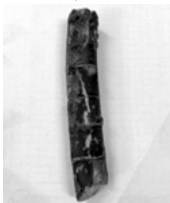
Figure 1. Dieffenbachia plant stem

Dieffenbachia is a very commonly used decorative plant which has proven to be very dangerous if ingested due to progressive swelling of tongue and adjacent tissues interfering with the airway, causing respiratory distress. Dieffenbachia causes severe local injury to the tissues due to the insoluble calcium oxalate crystals present in the plant juice. There are reports of airway compromise due to accidental ingestion. 4 Due to the nature of the presentation, exposure can easily be