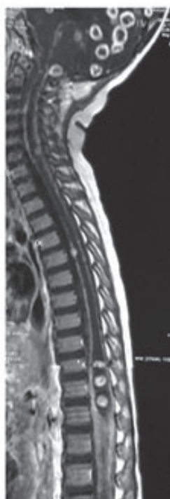
Figure 2. MRI spine showing spinal granulomas