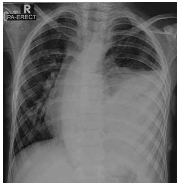
Figure 1. Shows erect chest radiograph during his presentation which shows left massive pleural effusion.