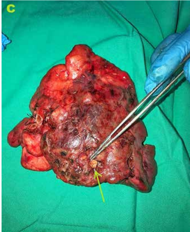
Figure 3C. Shows the gross sample of the excised hybrid lesion with the arrow showing the feeding vessel.

which is described as a non-functioning lung tissue invested within the same pleura as normal lung, with an aberrant arterial supply from the systemic vasculature and drainage into the pulmonary or systemic veins. The non-functioning lung tissue displays features of type II CPAM with multi cystic areas of over proliferation and dilatation of terminal respiratory bronchioles, lacking normal alveoli. 2,3